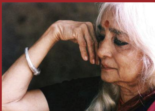
Honouring the Life and Art of Chandralekha

Best Western Primrose Hotel, Betty Oliphant Theatre at Canada's National Ballet School and Fleck Dance Theatre at Harbourfront Centre, Toronto, Canada